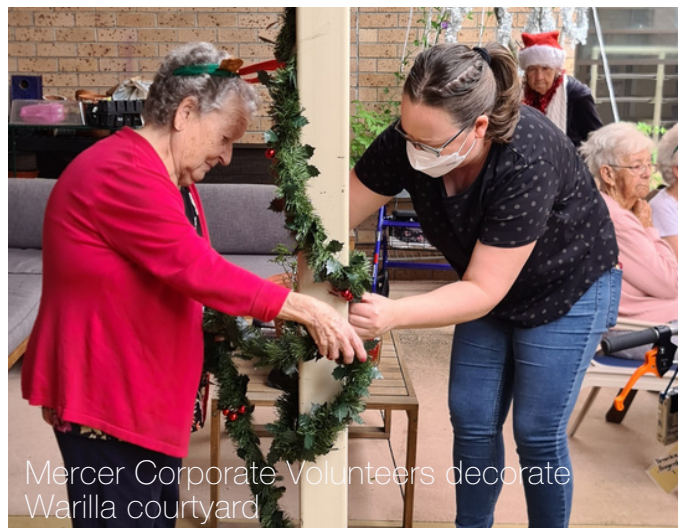
Mercer Corporate Volunteers decorate Warilla courtyard