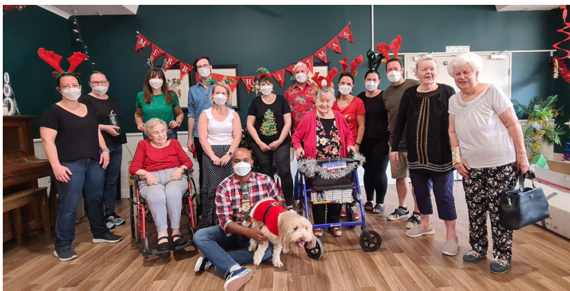
Mercer Corporate Volunteers decorate Warilla