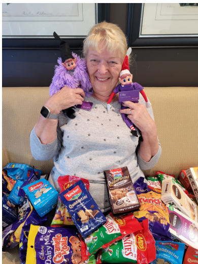
Illawarra Auxiliary donations