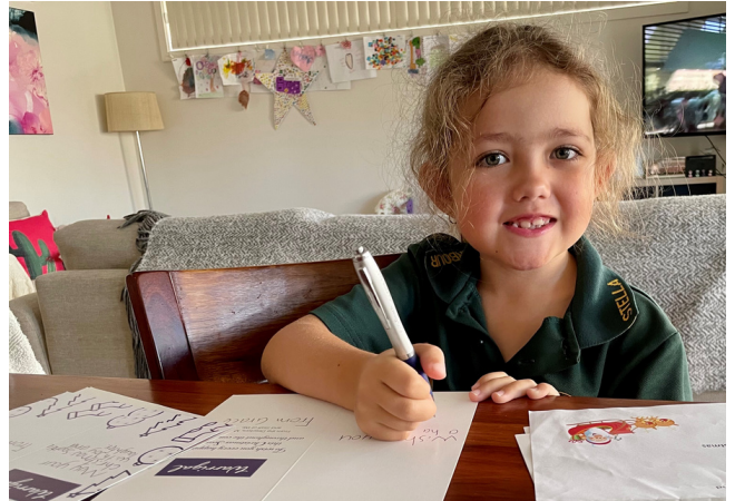
Year 1 Stella Maris who wrote Christmas cards

THANK YOU to everyone who have generously donated items, wrote on Christmas cards, knitted items, helped pack hampers for our lonely and isolated customers and decorated our homes this Christmas.