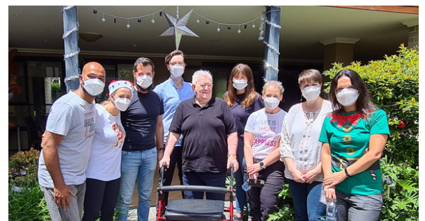
Mercer Corporate Volunteers decorate Mt Terry